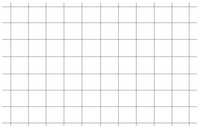
Matrix 2. Risk rating matrix.